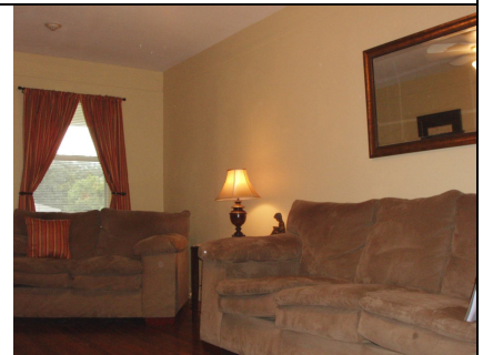
A comfortable, welcoming living room.