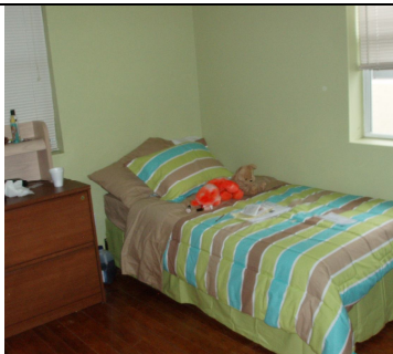
Another bright, cheerful room.