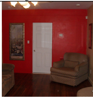
Living room accent wall and art work.