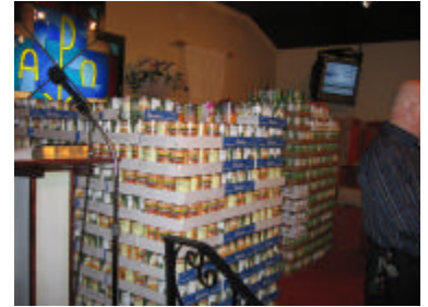
Food ready to be packed

WRC is proud to be a part of this very worthy cause.