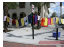
T-shirts displayed along the street

The Baldwin Park Arts Festival made the Clothesline Project available to a whole new audience. Our thanks to the Baldwin Park Arts Festival planning committee for making this venue available for this important project.