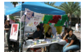
Counselors and WRC members on duty

WRC wishes you A Happy Holiday And A Prosperous New Year