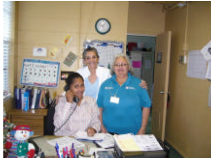
WRCC Staff is happy to receive the gifts for its clients.