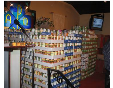
Food ready to be packed

WRC is proud to be a part of this very worthy cause.