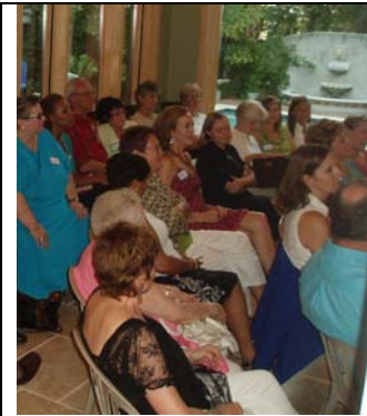
Over 50 people listened to the panelists.