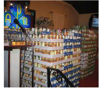
Food ready to be packed

Volunteers gathered before Thanksgiving at Joy MCC to assemble Thanksgiving baskets that included mashed potatoes, corn, green beans, gravy mix, cranberry sauce and a small holiday gift. Each basket (actually a bag), which included a frozen turkey added to each of the bags, provides enough food to feed ten people. The bags were then distributed through Central Florida Agencies that had signed up to receive and distribute the meals to underprivileged families that would be unable to afford a Thanksgiving dinner on their own.